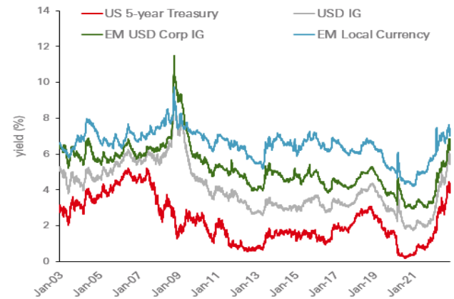
Chart 2: Global bond yields stay at historically high levels, almost back to the pre-2008 highs

Past performance is not a reliable indicator of future performance.