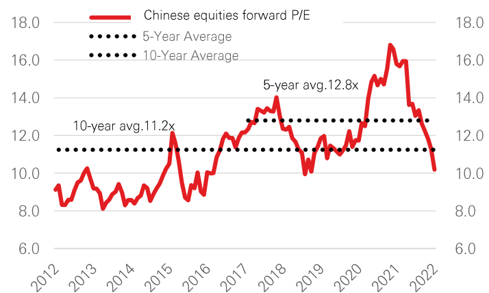
Chart 3: China equities' 12-month forward P/E ratio reaches the lowest level since 2018

Past performance is not a reliable indicator of future performance.